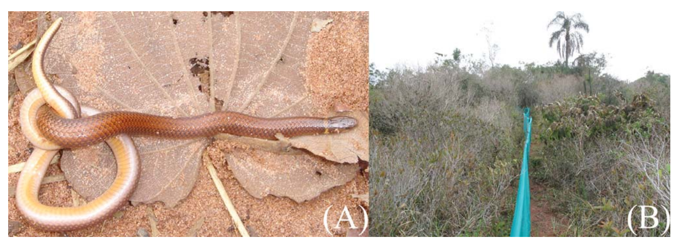
Figure 1 . (A) Phalotris lativittatus from Parque Estadual do Morro do Diabo (PEMD), municipality of Teodoro Sampaio, São Paulo, Brazil. (B) Line of pitfall trap with drift fences at cerrado sensu stricto, Parque Estadual do Morro do Diabo (PEMD).

Paulo, southeastern Brazil, collected during field samplings in February and May 2006. Both specimens, a male (MZUSP 15295) and a female (MZUSP 15296), were deposited at Museu de Zoologia of Universidade de São Paulo. Ventral and subcaudal scale counts of the male (198 and 30 scales, respectively) agree with the description given by Ferrarezzi (1994) (ventral scales: 182-199, mean = 187.7; subcaudal scales: 32-39, mean = 35.5), as well as the temporal formulae of both male and female specimens (0+1). Ventral scale counts of the female (205 scales) also agree with description of Ferrarezzi (1994) (196-208 scales, mean = 201.1), but subcaudal counts (51 scales) are higher than the values in his study (23-33 scales, mean = 27.2). The specimens were captured by pitfall traps with drift fences (30 units of 100 L buckets and 330 m of drift fences) installed in a natural patch of cerrado sensu stricto physiognomy in PEMD (22°28'07.3" S, 52°20'33.1" W; Figure 1B).