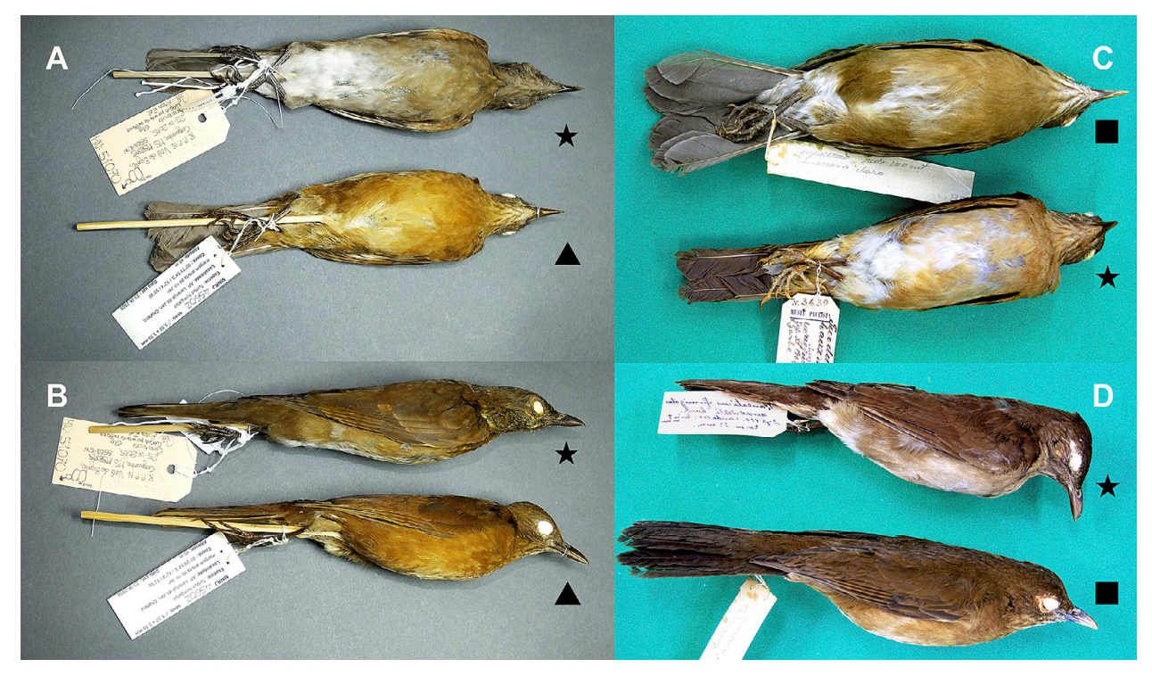
Figure 2. Ventral ( A , C ) and lateral ( B , D ) views of Hauxwell's Thrush, T. hauxwelli (stars), Cocoa Thrush, T. fumigatus (triangles, MN 45602, Laranjal do Jari, Amapá), and Várzea Thrush T. sanchezorum (squares, MZUSP 61917, Lago Beruri, Amazonas). Collected specimen of T. hauxwelli (MN 51070, RPPN Vale do Bugio, Corguinho, Mato Grosso do Sul) ( A , B ), other T. hauxwelli (C, D, MZUSP 3639, Rio Juruá, Amazonas). Note the white mid-belly and crissum, typical diagnostic character of T. hauxwelli when compared to T. fumigatus , and the feathered orbital ring, less contrasting streaks on the throat, and dark-brown (not olive) when compared to T. sanchezorum .

the field. The specimen was collected (SISBIO permit number 10613, ICMBIO, Instituto Chico Mendes de Conservação e Biodiversidade), euthanized according to Brazilian laws, prepared as study skin and deposited in the Ornithological Collection of Museu Nacional, Universidade Federal do Rio de Janeiro, Rio de Janeiro, RJ, Brazil, under the accession number MN 51070. Gonads were examined in the laboratory to determine the specimen's sex. The carcass was fixed in 4% formalin, subsequently preserved in 70% ethanol and given the same accession number as the skin. A tissue sample was taken from the breast and stored in alcohol 100% (accession number MNT 4286).