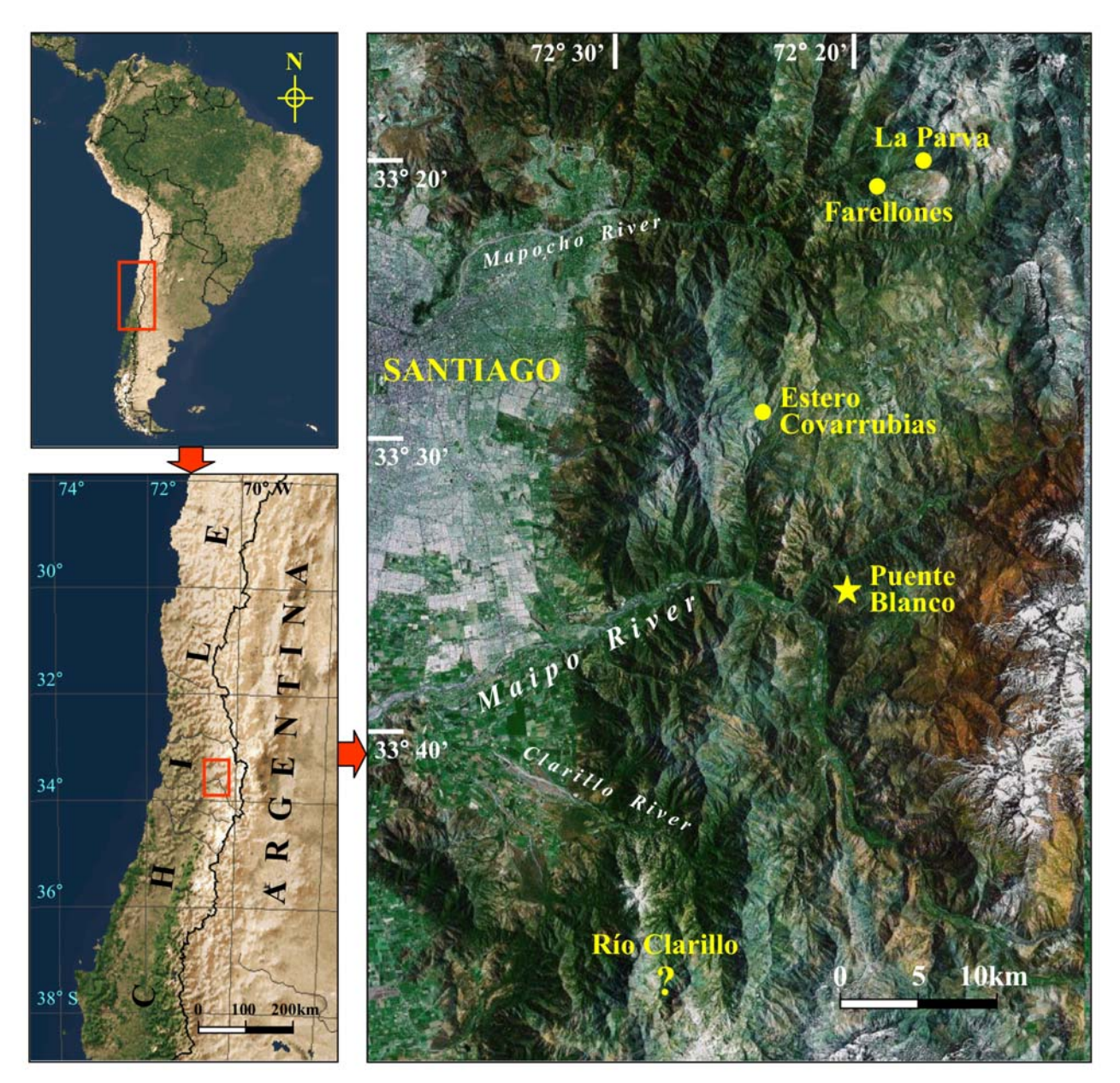
Figure 1. Distribution map of Alsodes montanus showing all localities cited in the literature and the new locality, Puente Blanco, described in this report. The question mark represents the locality whose exact location is unknown.

The new locality, Puente Blanco (33°37'58.9" S, 70°19'00.2" W, 1455 m), is 32 km south of Farellones and about 30 km southeast of Santiago (Figures 1 and 2).