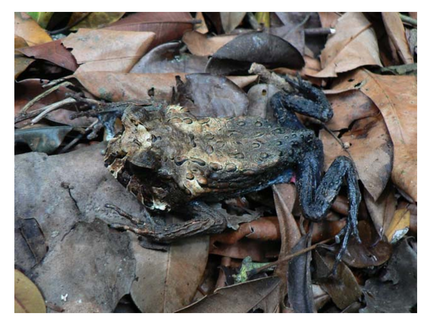
Figure 1. Juvenile of Macrogenioglottus alipioi from municipality of Campo Alegre, state of Alagoas, Brazil.

Macrogenioglottus alipioi (Figure 1) was described by Carvalho (1946) based on specimens from Ilhéus, state of Bahia, Brazil. According to Abravava and Jackson (1978), the sonogram of the advertisement call of M. alipioi is similar to that of Odontophrynus americanus and the tadpoles of Macrogenioglottus are similar to those of Odontophrynus, having the same tooth row formula and similar arrangement of labial papillae. They differ, however, in the positions of the spiracle and of the vent. According to Abravaya and Jackson (1978) a review of the taxonomic history of M. alipioi suggests a close relationship between Macrogenioglottus and Odontophrynus.