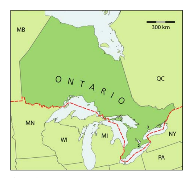
Figure 1. The province of Ontario, showing the two localities mentioned in the text, Grand River (1 and 2) and Bowmanville Creek (3).

The samples often contain large numbers of shells that were sorted out by hand. Of the eight samples that we have sorted, three contained shells of Carychium minimum and Cecilioides acicula and are reported here (Table 1, Figure 1). The Grand River and Bowmanville Creek drainages include extensive farmland and urban areas with small patches of woods. All specimens have been retained in the personal collection of RGF.