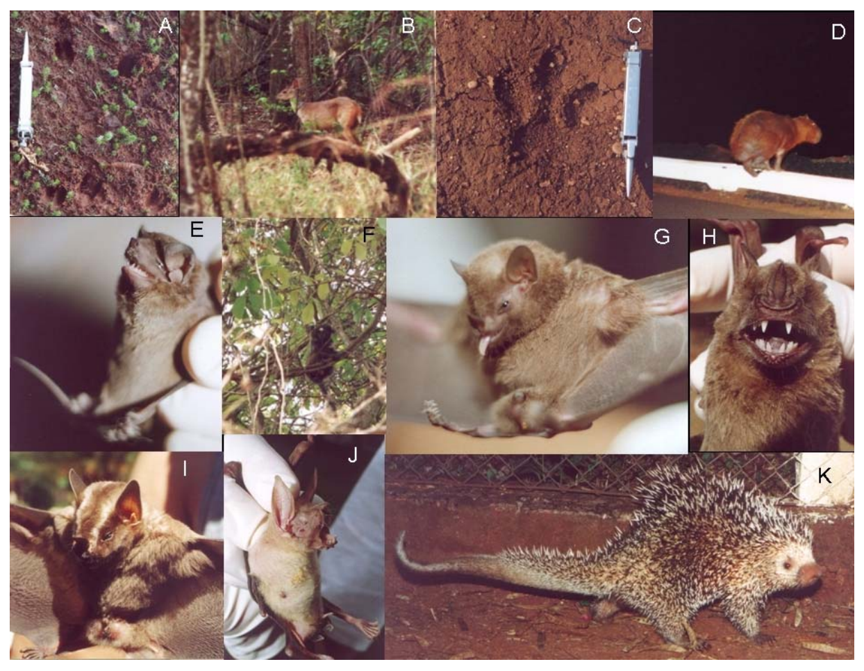
Figure 2 . Some mammals recorded in the Volta Grande Environmental Unity, on samples made between 2003 and 2004. A, tracks of Mazama gouazoubira ; B, individual of Mazama gouazoubira ; C, tracks of Hydrochoerus hydrochaeris ; D, Hydrochoerus hydrochaeris ; E, Molossus molossus ; F, Callithrix penicillata ; G, Glossophaga soricina ; H, Artibeus lituratus ; I, Platyrrhinus lineatus ; J, Noctilio albiventris ; K, Coendou prehensilis . Referential scale figured in tracks photos are of approximately 15 cm.

Carnivores were the rarest mammals recorded. A couple of Crab-eating foxes ( Cerdocyon thous ) was seen crossing the limits of the reserve and tracks of the Manned wolf ( Chrysocyon brachyurus ) could be identified along trails. In addition, the presence of this latter canid was recurrently reported by the reserve rangers and employees at both sides of the reserve.