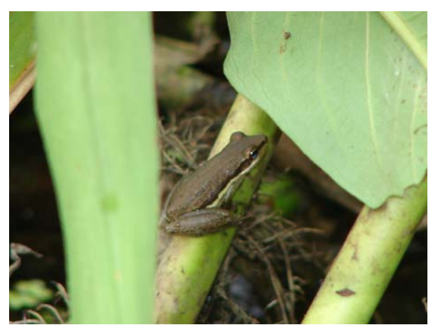
Figure 2 . Scarthyla vigilans from El Clavo Dam, northern Venezuela.

The record from the Venezuelan Coastal range is based on a single individual photographed (Figure 2) by ICF during a field botanical assessment development in a wetland near El Clavo Dam, state of Miranda (10°15'16.9" N, 66°07'53.9" W; 14 m), on 2 August 2007. In this locality, S. vigilans was particularly abundant and several males were observed calling actively at around 15:30 h, in grasslands, semiaquatic, and aquatic foliage of the wetland.