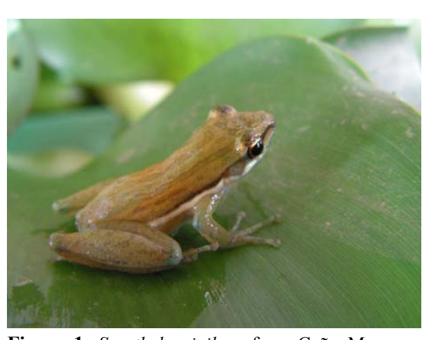
Figure 1 . Scarthyla vigilans from Caño Macareo, northwestern Venezuela.

During a biodiversity survey carried out in Caño Macareo in the Orinoco Delta, state of Delta Amacuro, northeastern Venezuela (09°48'32" N, 61°40'29" W; 5m), from 16 to 25 May 2006, FRR and JCS found several specimens of Scarthyla vigilans (Figure 1). Six specimens were collected and deposited at the Museo de Historia Natural La Salle , Caracas (MHNLS 17734, 17754-8).