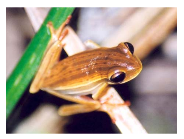
Figure 1 . Adult male of Hypsiboas beckeri from the municipality of São Thomé das Letras, state of Minas Gerais, southeastern Brazil.

Hypsiboas beckeri (Figure 1) is a small tree frog (mean SVL 29 mm in males and 33 mm in females) described by Caramaschi and Cruz (2004). This species is known from the type locality: Morro do Ferro (ca. 20°46'00.25" S, 44°35'00.00" W; 1,200 m), municipality of Poços de Caldas (Caramaschi and Cruz 2004) and from the Serra da Pedra Branca (22°11'16.1" S, 45°23'23.5" W), municipality of Pedralva (Orrico and Luna-Dias Neto 2006), both in the state of Minas Gerais, southeastern Brazil. Data on the ecology and natural history of Hypsiboas beckeri is scarce and, therefore, it is considered data deficient by the IUCN list (Stuart 2006).