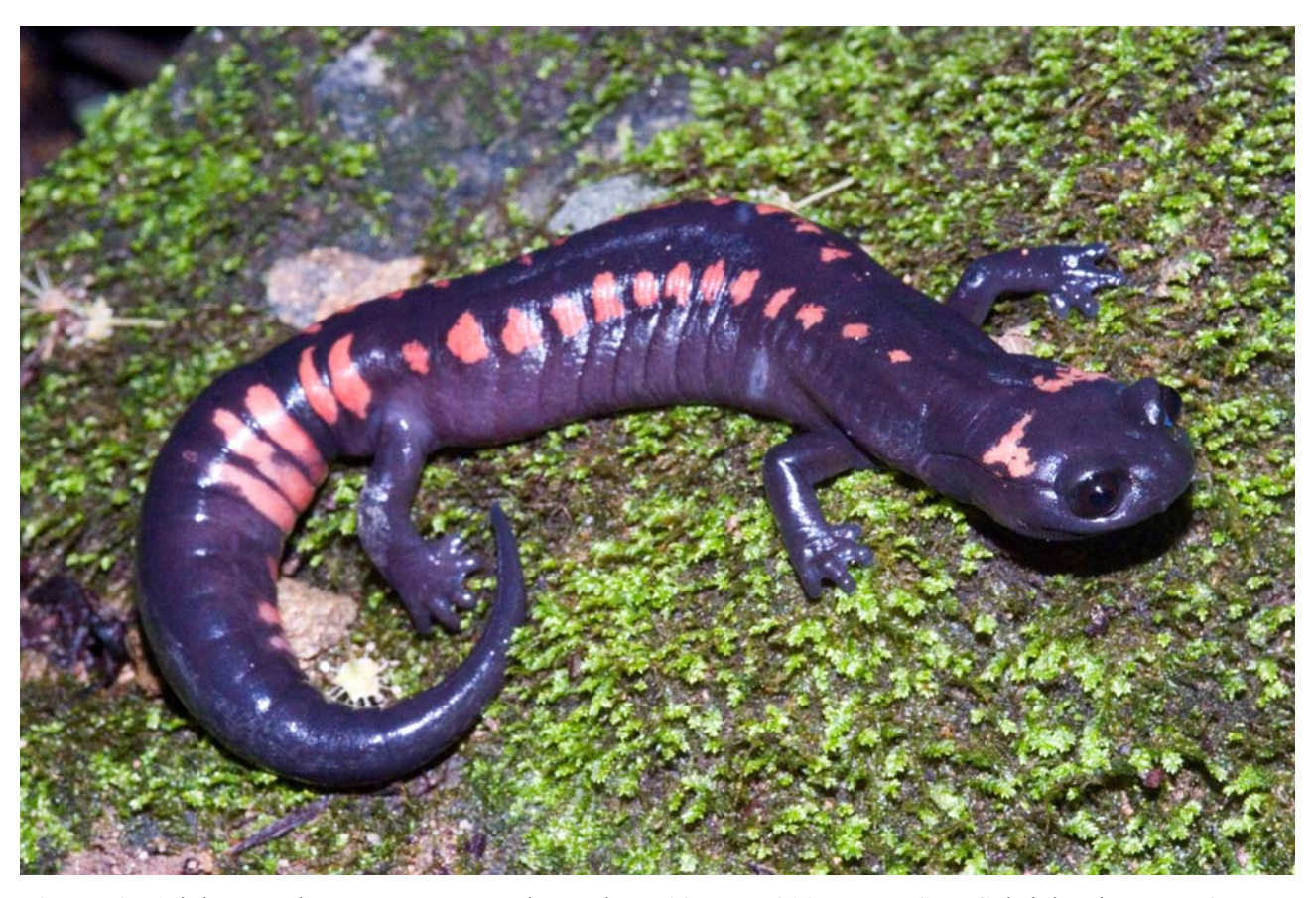
Figure 2. Adult Pseudoeurycea maxima located on 09 June 2007, near San Gabriel Mixtepec, Oaxaca, Mexico.

The current conservation status of P. maxima is listed by the IUCN as Data Deficient, with the possibility of qualifying it as Least Concern if its area of occupancy is more widespread then currently registered (IUCN 2007). While large expanses of LMDF have suffered alteration, with an increasing area subject to deforestation, large tracks of forest remain intact within the area occupied by this species. In addition, this species has been documented in altered areas like road cuts, banana plantations (Parra-Olea et al. 2005), and in fragmented secondary forest (this work).