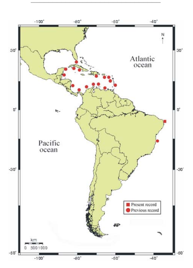
Figure 1 . Presently known range of the snapping shrimp Alpheus simus Guérin-Méneville, 1856.

The material examined consists of a single male specimen, which was fixed in ethanol 70 %, identified following the key in Chace (1972), and deposited in the carcinological collection of the Museu de Zoologia , Universidade Estadual de Santa Cruz (MZUESC#995), in Ilhéus, state of Bahia, Brazil.