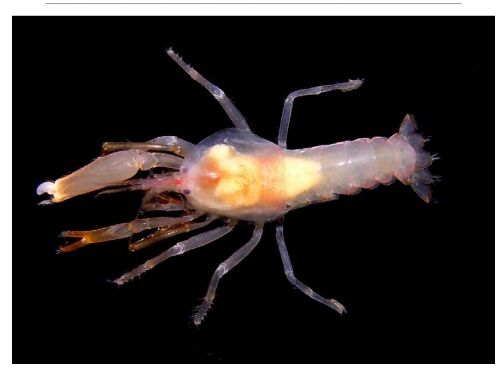
Figure 3 . Alpheus simus Guérin-Méneville, 1856, male in dorsal view from Isla Grande, Caribbean coast of Panama.

Remarks: The membranous carapace of the specimen is partially damaged, precluding the drawing of the frontal region. The minor chela and the right second pereiopod are also missing. However, the main diagnostic features of A. simus are readily recognized in our specimen, such as the absence of a rostrum, the emarginated front, and the typical hammer-shaped dactylus of the major chela (Figure 2A). The dorsal region of the telson is free of spines; the distolateral angles are each armed with one small subdistal spine; the posterior margin bears three pairs of spines of different length (the submedian pair is the largest and the most-lateral the shortest) in addition to several setae. The propodus of the third and fourth pereiopods has three strong single movable spines, in addition to a distal pair of spines, close to dactylus. The distal pair is also present in the fifth pereiopod, but only two weaker single movable spines are present on the propodus (Figure 2D, F, H).