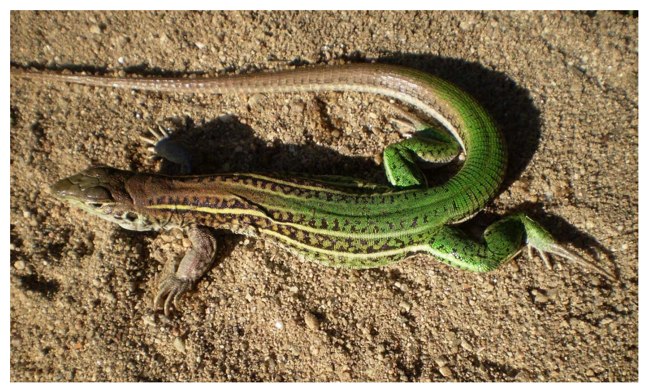
Figure 2. Adult female of Teius teyou , syntopic and sympatric with T. suquiensis at Ranch El Cercado.