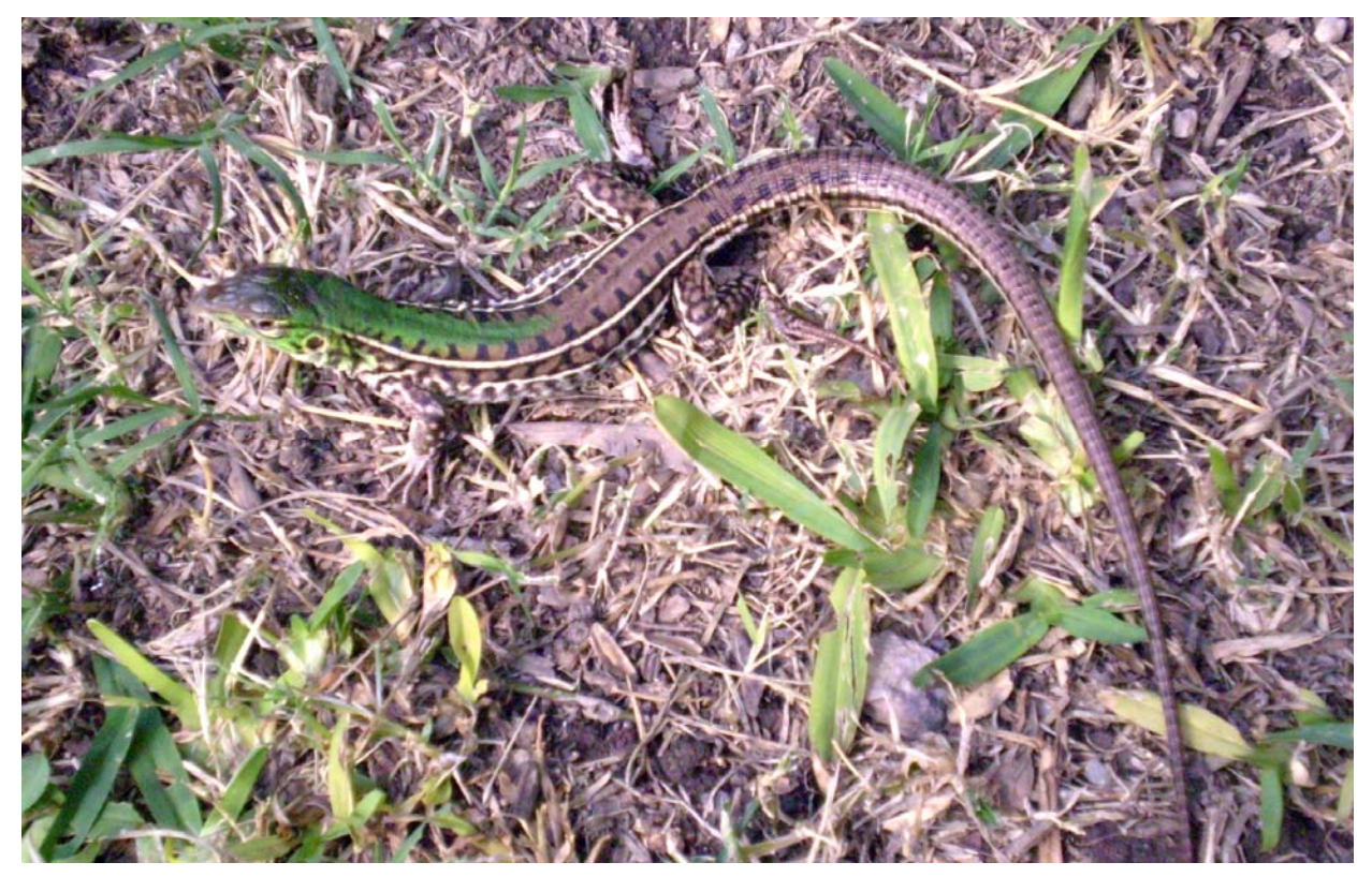
Figure 1. Adult of the all-female species Teius suquiensis from Ranch El Cercado, Department of Sobremonte, Córdoba, Argentina.