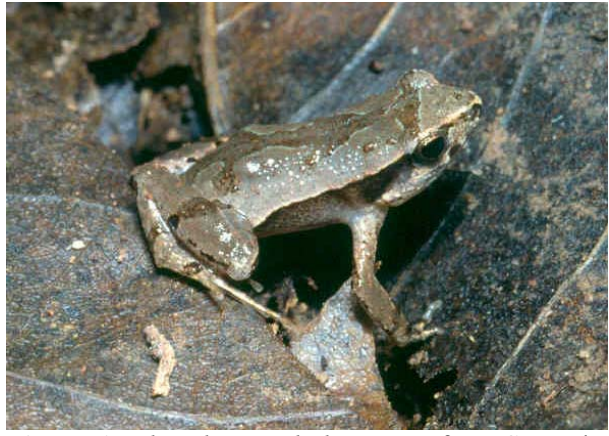
Figure 1. Physalaemus bokermanni from Serra de Paranapiacaba, municipality of Santo André, state of São Paulo, Brazil.