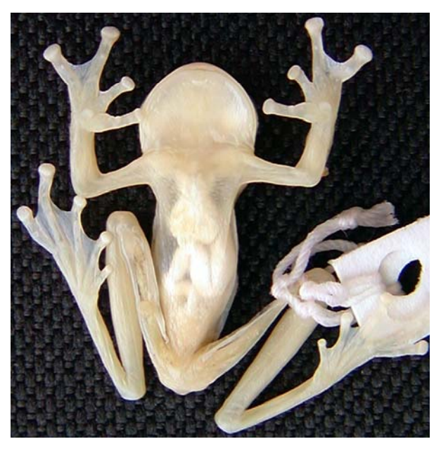
Figure 2. Ventral view of a specimen of Centrolene mariaelenae (QCAZ 18618) collected at the Hollín River, province of Napo, Ecuador, on 10 December 2001.