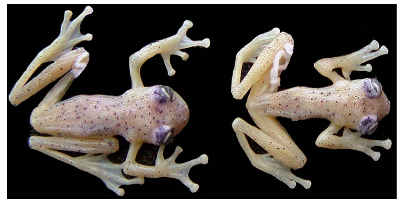
Figure 1. Dorsal view of specimens of Centrolene mariaelenae (QCAZ 18618-9) collected at the Hollín River, province of Napo, Ecuador, on 10 December 2001.