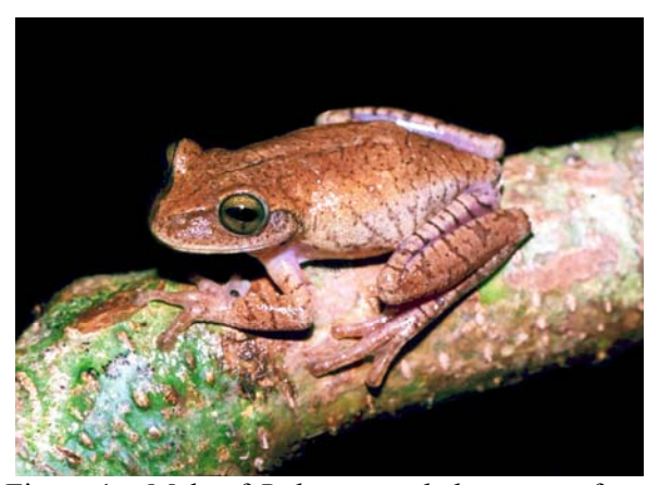
Figure 1 – Male of Bokermannohyla sazimai from the municipality of Araxá, Minas Gerais state, Brazil.

During a field expedition to the municipality of Araxá, on 19 March 2006, we collected the specimen of B. sazimai (Figure 1) in the locality of "Mata da Cascatinha" (46°57'17" W, 19°39'35" S; 1072 m a.s.l.), a small protected area of deciduous forest (about 5 ha) in a legal reserve that belongs to the Bunge Fertilizantes S.A. Bokermannohyla sazimai was first recorded by the call emitted by a male. The adult male was found on a leaf about 30 cm above the ground on a steep slope, approximately 4 cm above a stream. The specimen was deposited in the Célio F. B. Haddad Collection (CFBH 11575), Universidade Estadual Paulista, Rio Claro, São Paulo, Brazil.