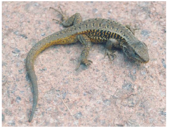
Figure 3. An adult male of Liolaemus pictus from Neuquén, Argentina.

National Parks was made by Christie (1984) but without any reference to voucher specimens. Cei (1986) stated that the species is present in andean forest of Neuquén, Rio Negro and Chubut provinces mentioning the possibility that its distribution follow the remnants of Nothofagus forest south to Buenos Aires Lake in Santa Cruz province. However, in its distribution map only the localities in southwestern Rio Negro province (Nahuel Huapi Lake and El Bolsón region) and around Buenos Aires Lake are marked without any locality in western Chubut. Christie (1984) stated that Liolaemus pictus argentinus is the only woodland lizard found south of Nahuel Huapi Lake. After several field trips, we did not found any Liolaemus pictus population around Buenos Aires Lake, and suitable habitats are scarce at least in this Argentinean region. In the Chilean region, Liolaemus pictus subspecies are not known south of 43° S (Vidal et al., 2006) and recent surveys in the Aysen region (at the same latitude of Buenos Aires Lake) did not register this species (P. Victoriano, pers. com.).