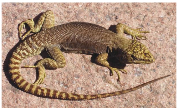
Figure 1. An adult male of Liolaemus petrophilus from central Chubut, Argentina.

carried out between 1998 and 2006 to Chubut and Rio Negro provinces resulted in the collection of a considerable number of samples of Liolaemus petrophilus . Those samples fill distributional gaps and four of them represent significant new geographic records for the species.