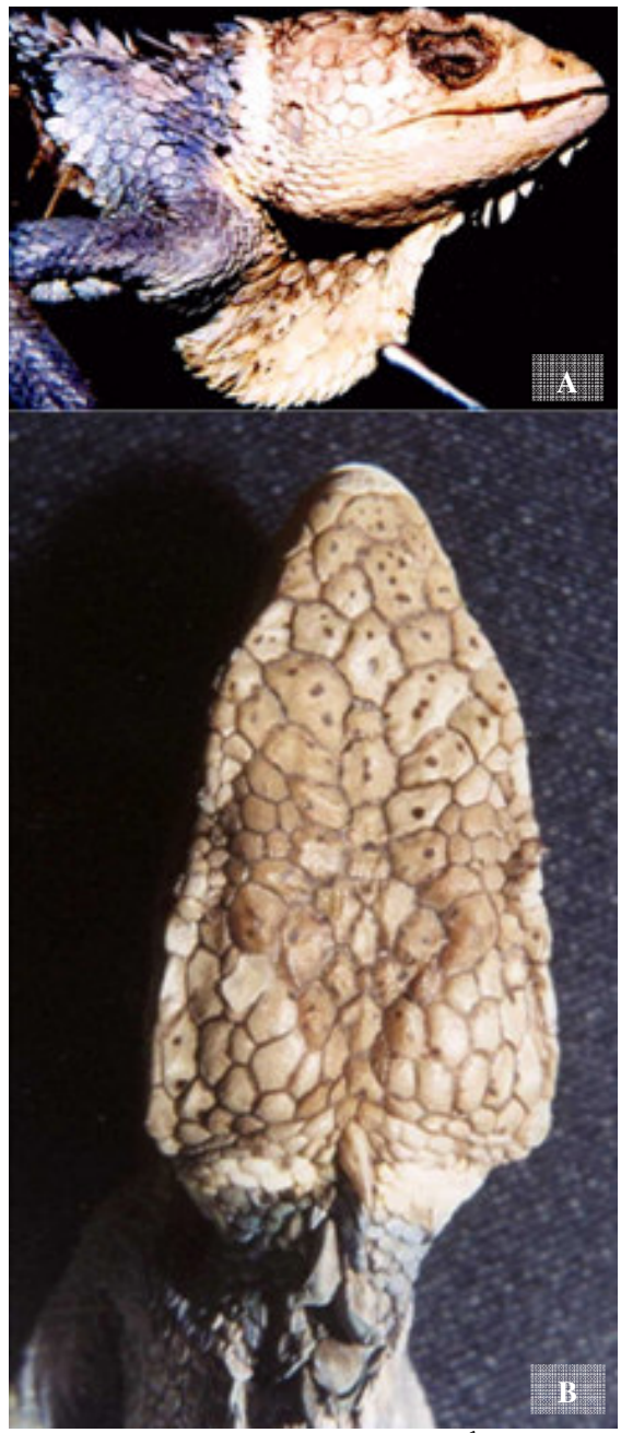
Figure 2. A) Polychrus peruvianus \Im DHMECN 01762, lateral view of head; and B) dorsal view of head.