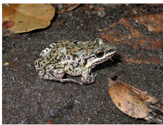
Figure 1 . Leptodactylus caatingae , MNRJ40825, at municipality of São João do Cariri, state of Paraíba, Brazil.

Brazil. Individuals of L. caatingae (Figure 1) were found in these temporary ponds and identified based on the original description. The specimens were deposited in the Museu Nacional do Rio de Janeiro (MNRJ40825, MNRJ40826, MNRJ40827) and in the Coleção Herpetológica do Departamento de Sistemática e Ecologia da Universidade Federal da Paraíba (UFPB 4310 – 4314), Brazil.