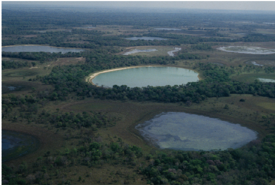
Figure 3. A typical shallow bays and salt lagoons (center of the photo) system at the Pantanal do Rio Negro, Brazil.

Probably the species is also distributed near the municipality of Coxim (ca. 18°33'45" S, 54°41'15" W) in a typical Cerrado habitat, since one of us (FLS) identified a turtle skeletal from that locality. This late record could extend the geographical distribution of A. macrocephala ca. 65 km northeast from the nearest record (Figure 4). However, further observations in Coxim region are needed to clarify if this record come from a real population or simply represent an introduction by local people.