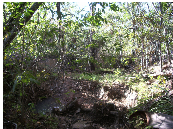
Figure 2. An intermittent stream in a semideciduous forest at Serra de Maracaju.

Although both records also belong to the Paraguay River basin, the habitat described above, at least for the Serra de Maracaju, constitutes a totally new type for A. macrocephala , which was early considered a typical shallow bays and salt lagoons dweller (Figure 3) (Mauro et al. 2004; Vincke and Vincke 2001). This suggests that A. macrocephala can explore a wide variety of habitat types than previously reported.