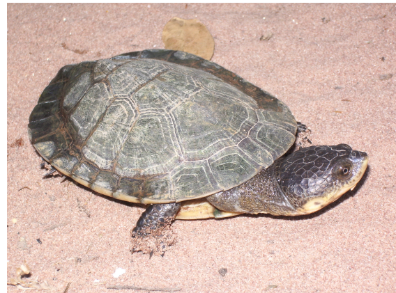
Figure 1. A juvenile Acanthochelys macrocephala captured in the Serra de Maracaju, Corguinho municipality, Mato Grosso do Sul state, Brazil.

areas with innumerable ponds (Figure 2). This record extends the known species distribution 120 km northeast from the Fazenda Rio Negro, Pantanal region.