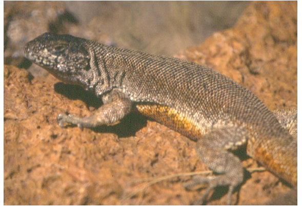
Figure 1. Adult male of Liolaemus punmahuida collected in Cordillera del Viento Mountains, Minas Department, Neuquén Province.