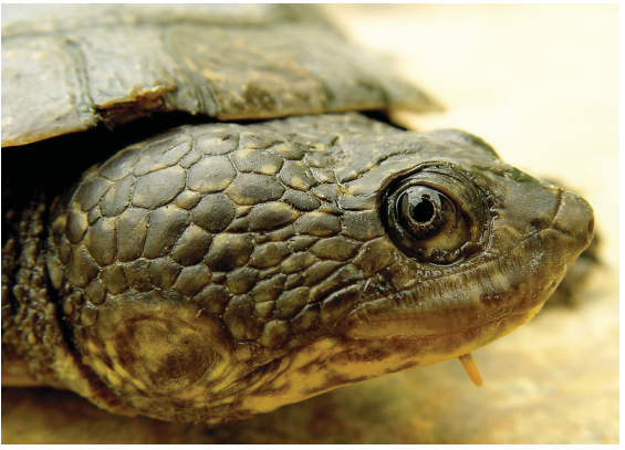
Figure 1. Head details of Mesoclemmys tuberculata collected in the Piauí state, northeastern Brazil.

According to Iverson (1992), M. tuberculata (sensu Bour and Zaher, 200) has a geographical distribution restricted to the Rio São Francisco and its adjacent basins, probably endemic to the Caatinga biome, northeastern Brazil. On June 30 2005, we collected one individual (female; Carapace length = 224 mm; Carapace width = 174 mm; Plastron length = 213 mm; Plastron width = 132 mm) of M. tuberculata (Figures 1 and 2) in Luís Correia city, Piauí state (02°53'43" S; 41°37'31" W, 14 m above sea level), extending species range in approx. 200 km towards west from previous reports (e.g. Bour and Zaher, 2005; Figure 3). The individual was wandering during day light at 1500 h across coastal dunes nearby PI 315 state highway (ca. 500 m from the coastline). This is the first record of the M. tuberculata within Piauí's littoral zone and constitutes the northernmost record for this species. The individual is deposited in the Herpetological collection of Instituto Nacional de Pesquisas da Amazônia, Manaus (INPA- H: 16020).