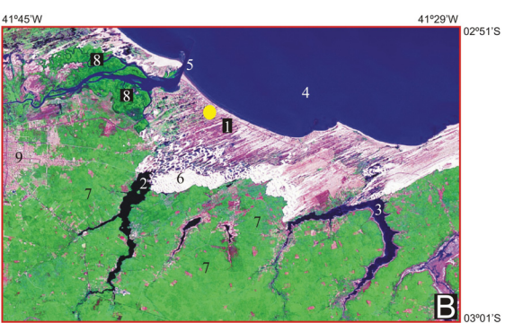
Figure 3. A) Geographic distribution of M. tuberculata according to Bour and Zaher, (2005) (yellow line), and the location where the specimen was collected at Piauí state (yellow dot). B) Detailed view of the area showing the most important ecosystems and landmarks: 1 = PI 315 state highway; 2 = Portinho Lagoon; 3 = Sobradinho Lagoon; 4 = Atlantic Ocean; 5 = Igaraçu River outlet; 6 = Coastal dunes; 7 = Caatinga; 8 = Mangroves; and 9 = Parnaíba city. Composition of satellite images Landsat 7 obtained from NASA.