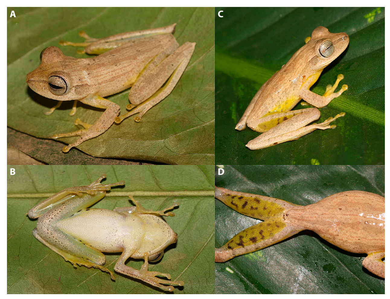
Figure 1. Adult males of Boana alfaroi from the municipality of Assis Brasil, State of Acre, northern Brazil. A, B. Specimen AAG-UFU 5919 (SVL 34.2 mm) in dorsolateral and ventral views from top to bottom. C, D. Specimen AAG-UFU 5917 (SVL 35.3 mm) in dorsolateral view and a detail of the hidden surface of thighs from top to bottom.

Six specimens were collected at night in a clearing of a secondary forest. Specimens were found perched up to 1.5 m high on broad leaves and twigs. The call voucher (AAG-UFU 5917; snout-vent length: 35.3 mm) was calling within 20 cm of the water surface in a flooded area. Males were heard calling infrequently.