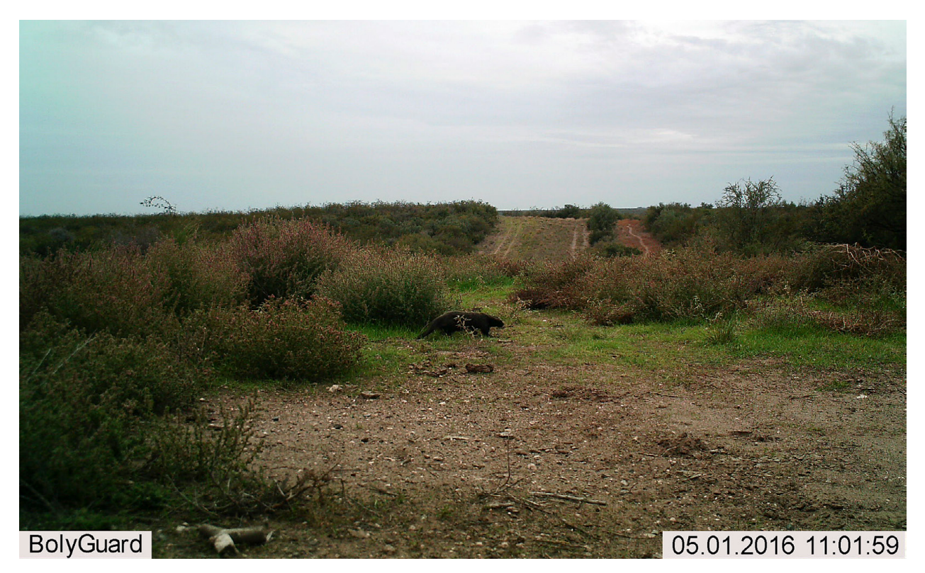
Figure 2. The only photographic record of Jaguarundi obtained in our landscape-scale remote camera trap survey that lasted from 2011 to 2016.

and captures), the occurrence of this species here was doubtful.