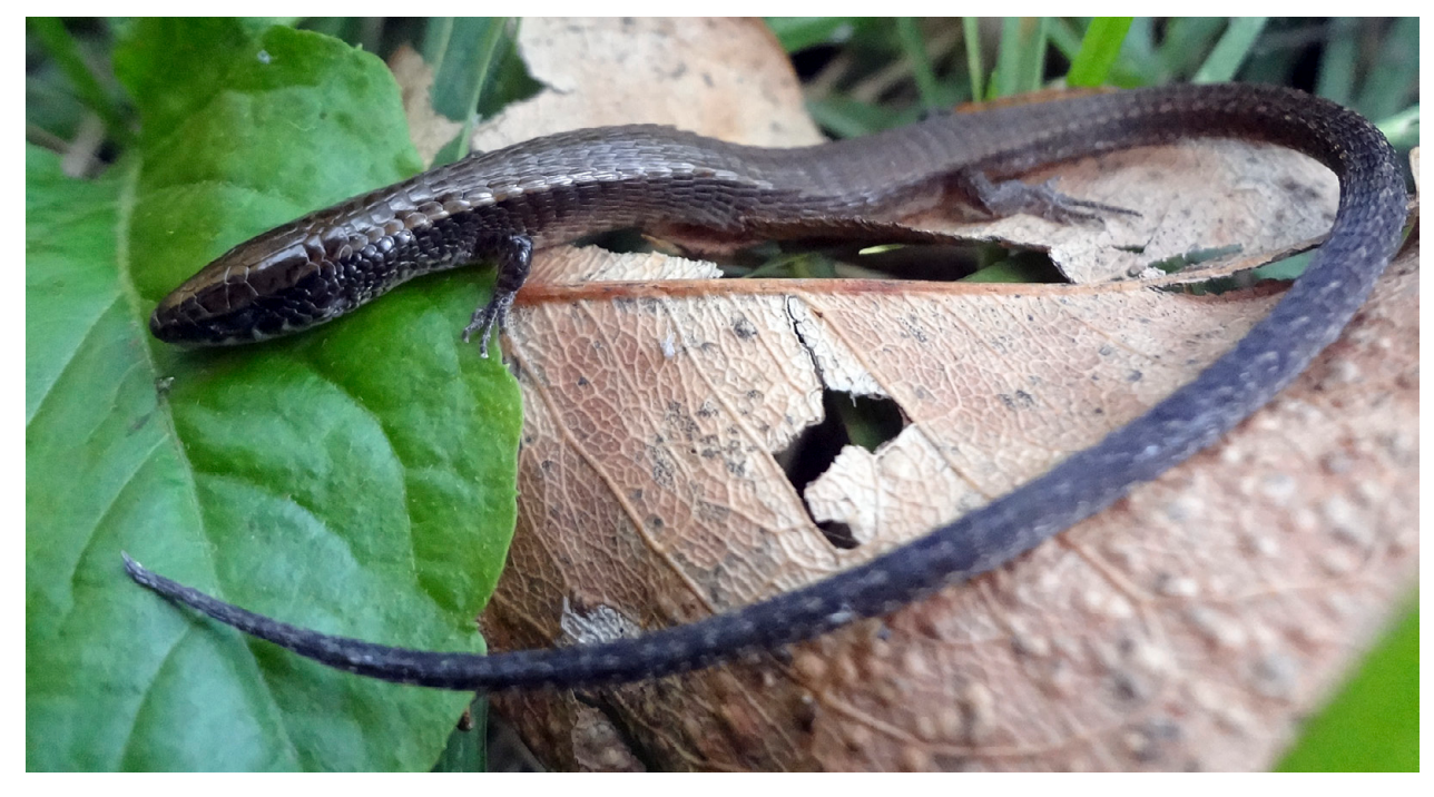
Figure 2. Specimen of Rondonops biscutatus MCP 19465 collected in the municipality of Vila Rica (-10.1258, -051.1369), state of Mato Grosso, Brazil.

Rondonops biscutatus is easily distinguished from R. xanthomystax by its supralabials with dark brown pigmentation (versus bright orange and yellow coloration on most of the supralabials, infralabials, and ventral surfaces of head and throat in R. xanthomystax ). In addition, scales on sides of neck are smooth in R. biscutatus (versus keeled in R. xanthomystax ). The specimen's morphology is in accordance with the diagnosis presented by Colli et al. (2015) for R. biscutatus .