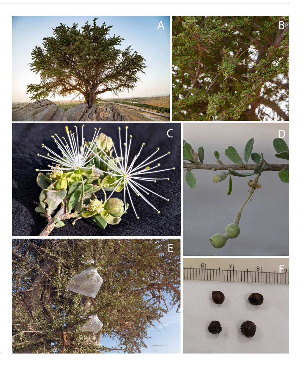
Figure 1. Maerua crassifolia Forssk. A. Habit. B. Clustered leaves on the branches. C. Flowers, represented by 30–40 stamens. D. Mature fruit. E. Fruits bagged to prevent insect attack. F. Seeds.

mountains and wadis, gravel plains, and urban habitats. The surveys were made during the summer and winter months. The field attributes were collected using an iPad-based IOS Collector App, which directly syncs with the plant database of the Environment Agency – Abu Dhabi (EAD). Specimens were collected and deposited in the EAD Herbarium. Specimens were identified using relevant literature and floras (Jong-bloed et al. 2003). The distribution map was prepared using ArcGIS v. 10.8.2 (ESRI 2019). Photographs of plant parts were taken in the field and deposited in the EAD photo library.