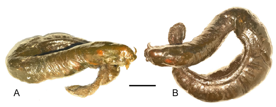
Figure 2. Eptatretus polytrema collected in Arica, Chile. A. Lateral view. B. Dorsal view. Scale bar = 3 cm.

070°19'16"W; 25 m depth; 17.XI.2018; F. Méndez-Abarca leg.; captured with speargun; 1 specimen, sex indet., COLECIC0369FRA.