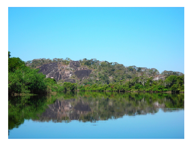
Figure 1. Landscape of Cerro Oricore (rock outcrops), Parque Departamental y Área Natural de Manejo Integrado Iténez, Beni, Bolivia.

All collected specimens were deposited in the herpetological collections of the Museo de Historia Natural Alcide d'Orbigny (MHNCR), Cochabamba and the Centro de Investigación de Recursos Acuáticos (CIRAH), Beni, Bolivia. Specimens were identified as