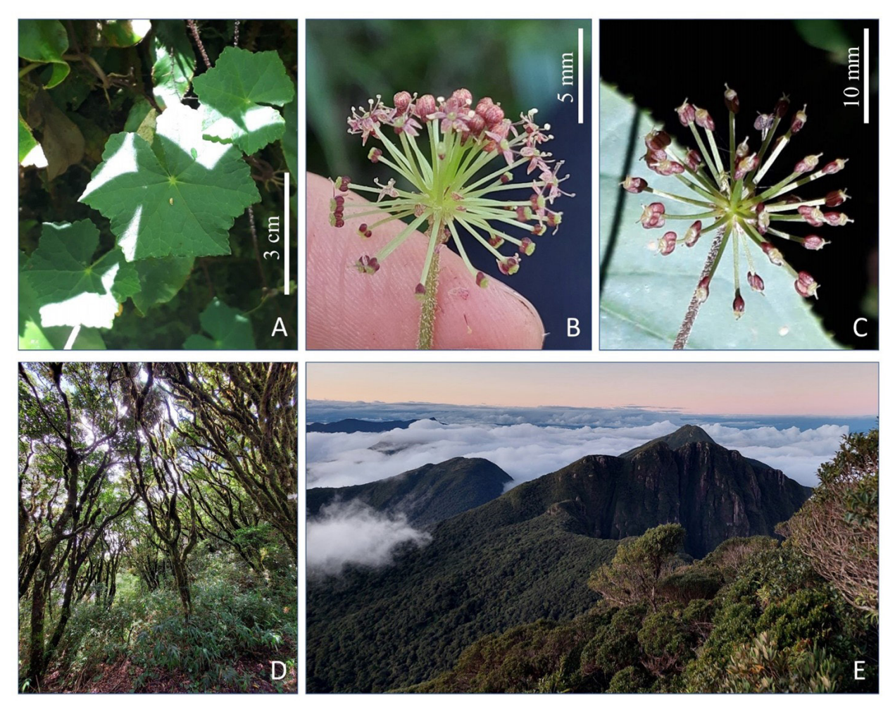
Figure 1. Hydrocotyle itatiaiensis Brade. A. Leaves. B. Umbel with floral buds, flowers, and young fruits. C. Umbel with fruits. D. Upper montane rainforest. E. Serra do Ibitiraquire seen from the Pico Caratuva.

and upper montane rainforests and highland grasslands (Brade 1946, 1948, 1951; Falkenberg and Voltolini 1995; Corrêa and Pirani 2005; Boldrini et al. 2009; Meireles et al. 2014). In Paraná, it was found at the Pico Caratuva, Serra do Ibitiraquire, at around 1500 m a.s.l, in the upper montane rainforest (the so-called "matinha nebular") and transition areas with montane rainforest (Fig. 1D). Another population was found at the Pico Taipabuçu, in the same mountain range, at 1650 m a.s.l., but only sterile individuals were seen.