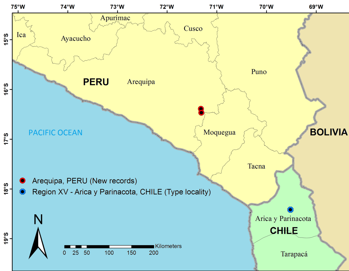
Figure 1. Distribution map of Negayan tarapaca (Lopardo, 2005).

28.10' S, 071°19.04' W), Oscar M. Quispe-Colca, VI-IX.2015, voucher number MUSA-Ar 020, 1♀ and 1 juvenile. Tuctumpaya (16°27.97' S, 071°18.62' W), Oscar M. Quispe-Colca, VII.2015, voucher number MUSA-Ar 021, 2♀ and 3 juveniles.