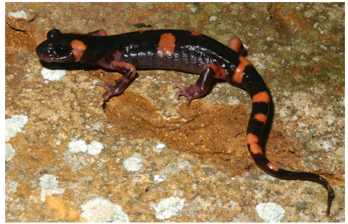
Figure 3: Adult Ensatina eschscholtzii klauberi (UABC 2060) from Volcan Riveroll.

On 7 March 2004, during the rainy season, we discovered a subadult Ensatina eschscholtzii klauberi , (Figure 2) under a small rock on the northeastern face of the Volcán Riveroll. Five additional specimens were later collected: four subadults between 13–25 March and one adult male (Figure 3) on 22 November 2004. The Snout-vent length (SVL) of the subadult specimens averaged 35.6 mm and ranged from 31.5 to 39.5 mm. The SVL in the adult male was 69.5 mm. Two subadults were found in crevices and the rest under rocks. Tissue samples from these specimens were included in Devitt et al. (2013).