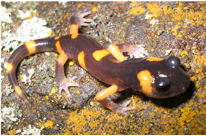
Figure 2. Subadult Ensatina eschscholtzii klauberi (UABC 1155) from Volcán Riveroll in the San Quintín volcanic field, Baja California, México.