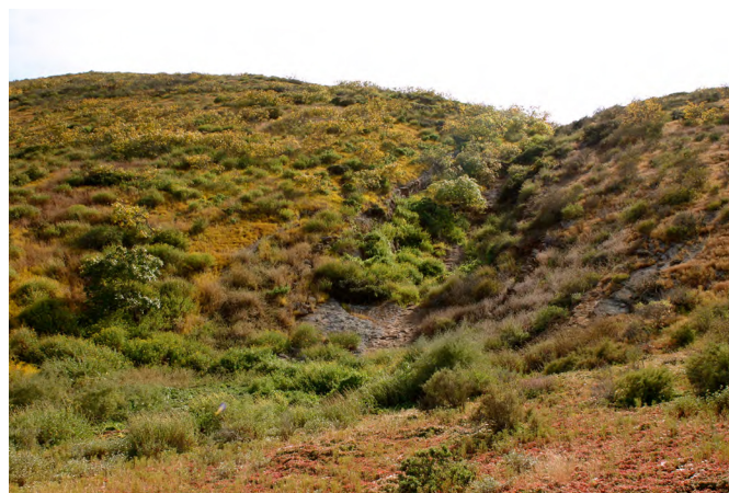
Figure 1. Habitat of the coastal population of Ensatina eschscholtzii klauberi in the San Quintín volcanic field, Baja California, México, located 3 km from the Pacific Ocean.

The San Quintín volcanic field lies along the Pacific coast of Baja California, about 260 km south of the U.S. border and consists of late Pleistocene to Holocene volcanic complexes (Storey et al. 1989; Luhr et al. 1995). The volcanic field contains xenoliths of upper mantle peridotites and lower crustal granulites making it unique within Baja California (Luhr et al. 1995). The vegetation at the site is comprised of coastal succulent scrub species (González-Abraham et al. 2010) dominated by Rhus integrifolia , Aesculus parryi , Encelia californica , Euphorbia misera and Selaginella bigelovii (Figure 1).